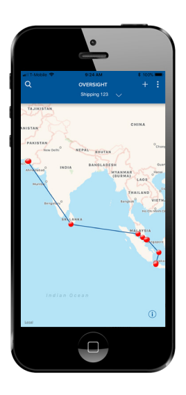
Oversight Mobile -Map Detail