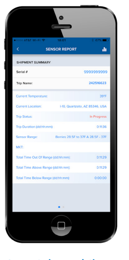
Oversight Mobile -Summary Report